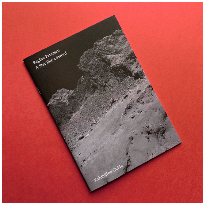
A Star like a Sword Exhibition Guide, 2023