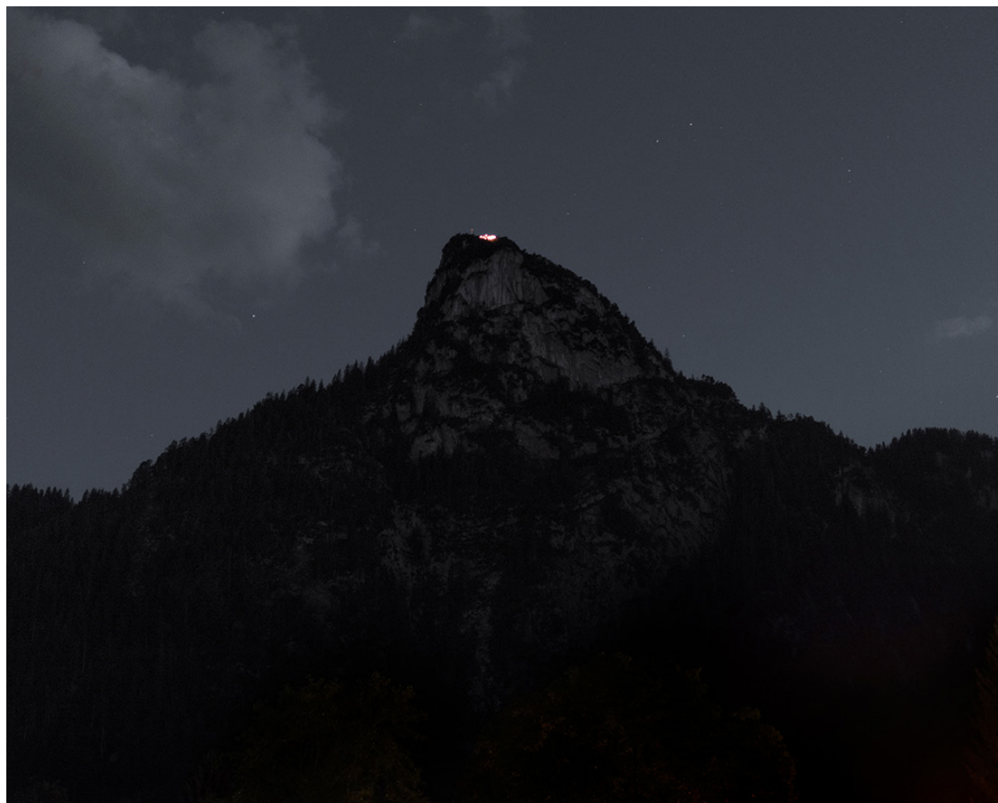
Kofel, Oberammergau Pigment ink print, 32 x 38 cm