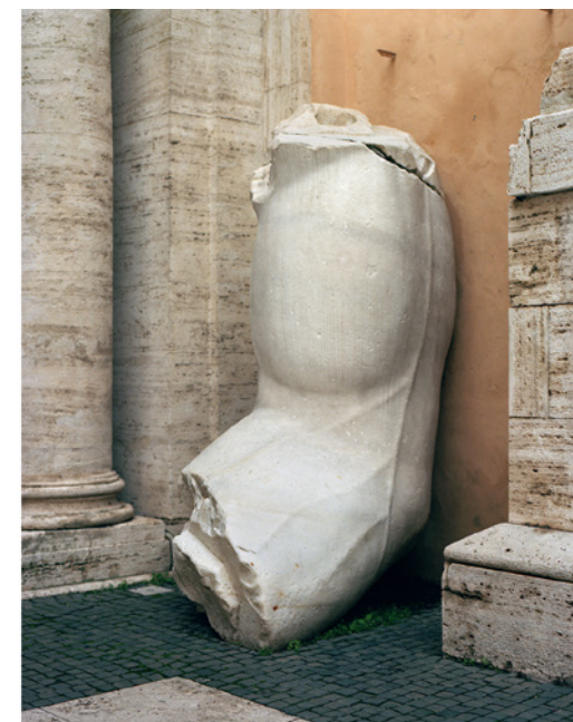
Constantine's Arm, Rome Pigment ink print, 26 x 22 cm