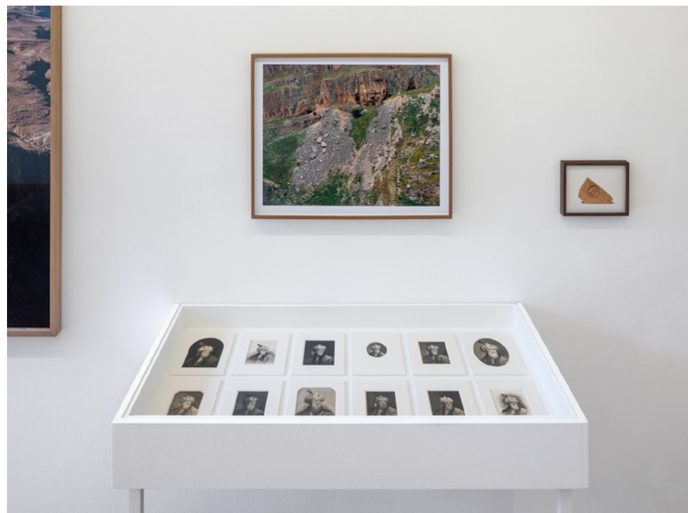
A Star like a Sword , Galerie Jo van de Loo, Munich, 2023