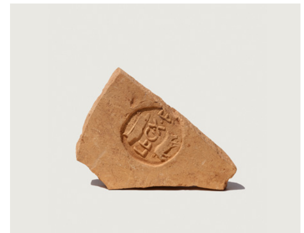
Legio X fretensis roof tile with boar emblem Collection: Israel Antiquities Authority